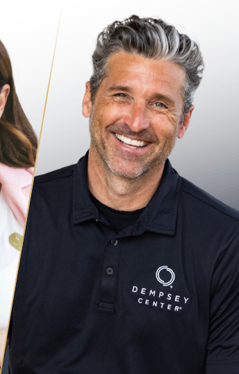
PATRICK DEMPSEY ACTOR, PRODUCER, PHILANTHROPIST AND FOUNDER, THE DEMPSEY CENTER