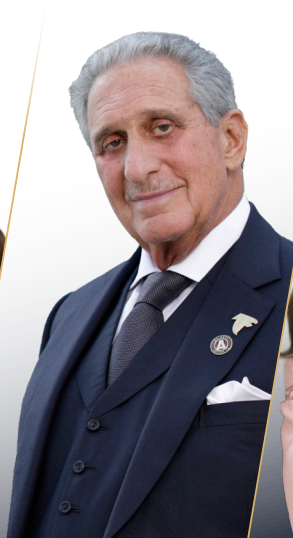
ARTHUR M. BLANK OWNER & CHAIRMAN, BLANK FAMILY OF BUSINESSES