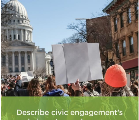
Describe civic engagement's role in a strong democracy Literature Review Objective #1

Regardless of the political or nonpolitical nature of