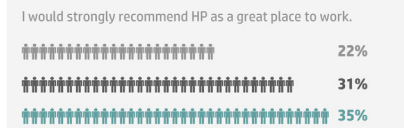
2. Percentage of respondents who selected "strongly agree" in the Employee Survey on Volunteering, 20,002 respondents globally, October 2012.